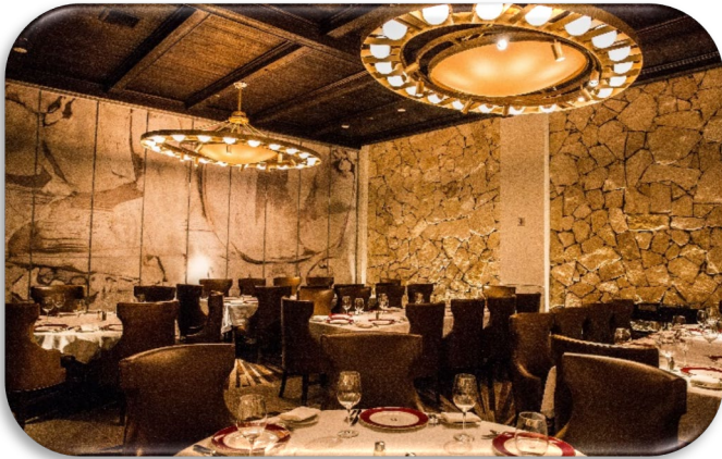
Cobblestone 1 & 2